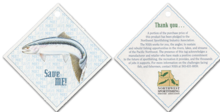
Hangtag example. Other formats available.

Product Endorsement contracts run on an annual basis from the date of signing. Contributions from product endorsement are payable quarterly starting from the date of signing or the date of distribution, which ever comes first. While NSIA encourages and supports the success of your product it is not in any way responsible for the results in marketing of said product. Thank you for your interest in our program and your support of NSIA. We look forward to reviewing your proposal.