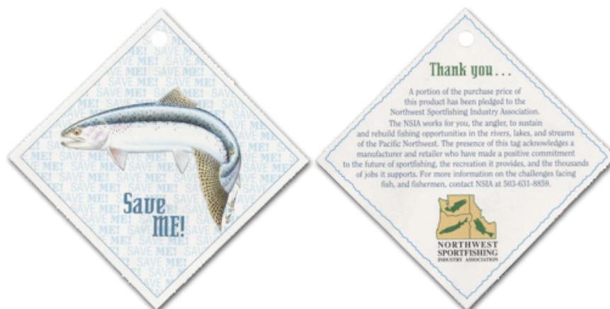
Hangtag example. Other formats available.

Product Endorsement contracts run on an annual basis from the date of signing. Contributions from product endorsement are payable quarterly starting from the date of signing or the date of distribution, which ever comes first. While NSIA encourages and supports the success of your product it is not in any way responsible for the results in marketing of said product. Thank you for your interest in our program and your support of NSIA. We look forward to reviewing your proposal.